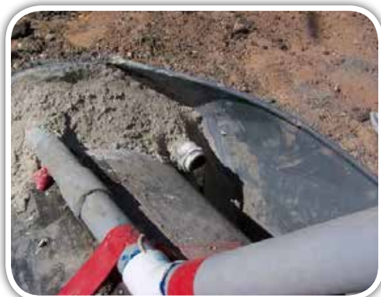
Grout can be seen exiting from the PVC port

The density (unit weight) of the material has a greater effect on the performance of the culvert rehabilitation than the compressive strength value of the grout. Practically any grout selected will be stronger than the bedding material around the host pipe. This is the material that the grout is intended to replace and serve in its absence.