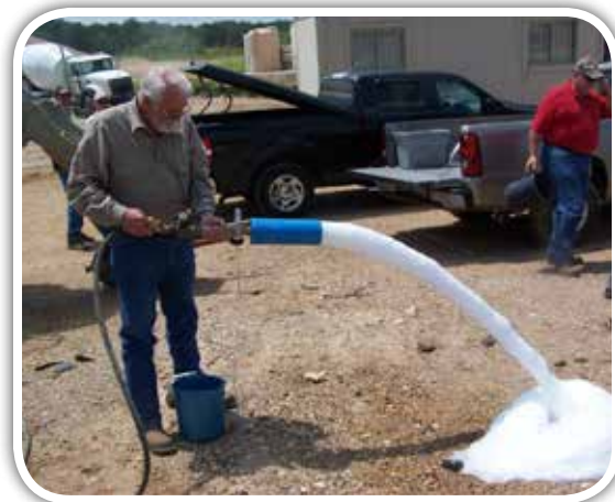
To produce cellular grout, a concentrated foaming agent is required in combination with various types of foam generating equipment. This equipment may generate foam via air pressure or water pressure.

Cellular grout is a low density grout mix comprised of cement and water (or cement, fly ash, and water) with a foaming agent added to inject a large volume of macroscopic air bubbles into the grout mix. This admixture greatly reduces the density, or unit weight, of the grout mix, and often will result in 40% or greater air content in the finished product. A foam generator unit is normally required to obtain such a high percentage of air and to reduce grout density. Most additive manufacturers report a maximum of 20% to